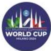
FIG RHYTHMIC GYMNASTICS WORLD CUP INDIVIDUAL AND GROUP MILAN (ITA) 21 - 23 JUNE 2024